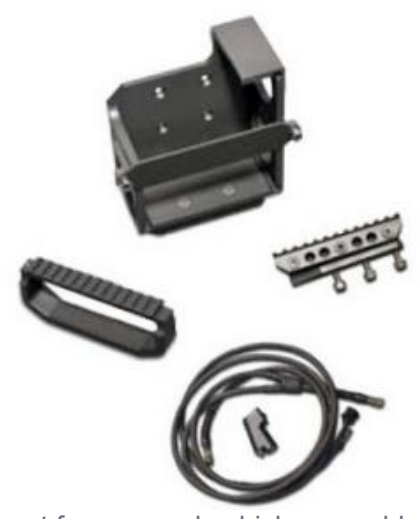
3D mount for armored vehicles - enables to adjust the light angle

TARGET-X weapon lights are used on weapon systems with up to .50 caliber HMG and on automatic grenade launchers.